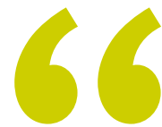
Illustration plays a fundamental role in the development of today's video games: master the main tools in this area thanks to the Advanced Master's Degree of TECH"