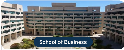
School of Business

The student will be able to do this program at the following centers: