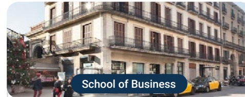
School of Business