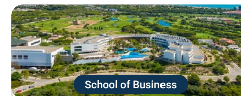
School of Business