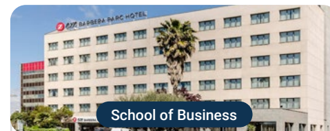
School of Business