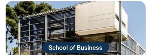
School of Business