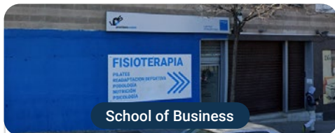
School of Business