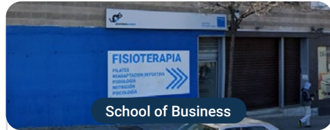
School of Business