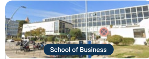
School of Business

The student will be able to do this program at the following centers: