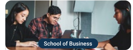
School of Business