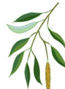
WHITE WILLOW BARK