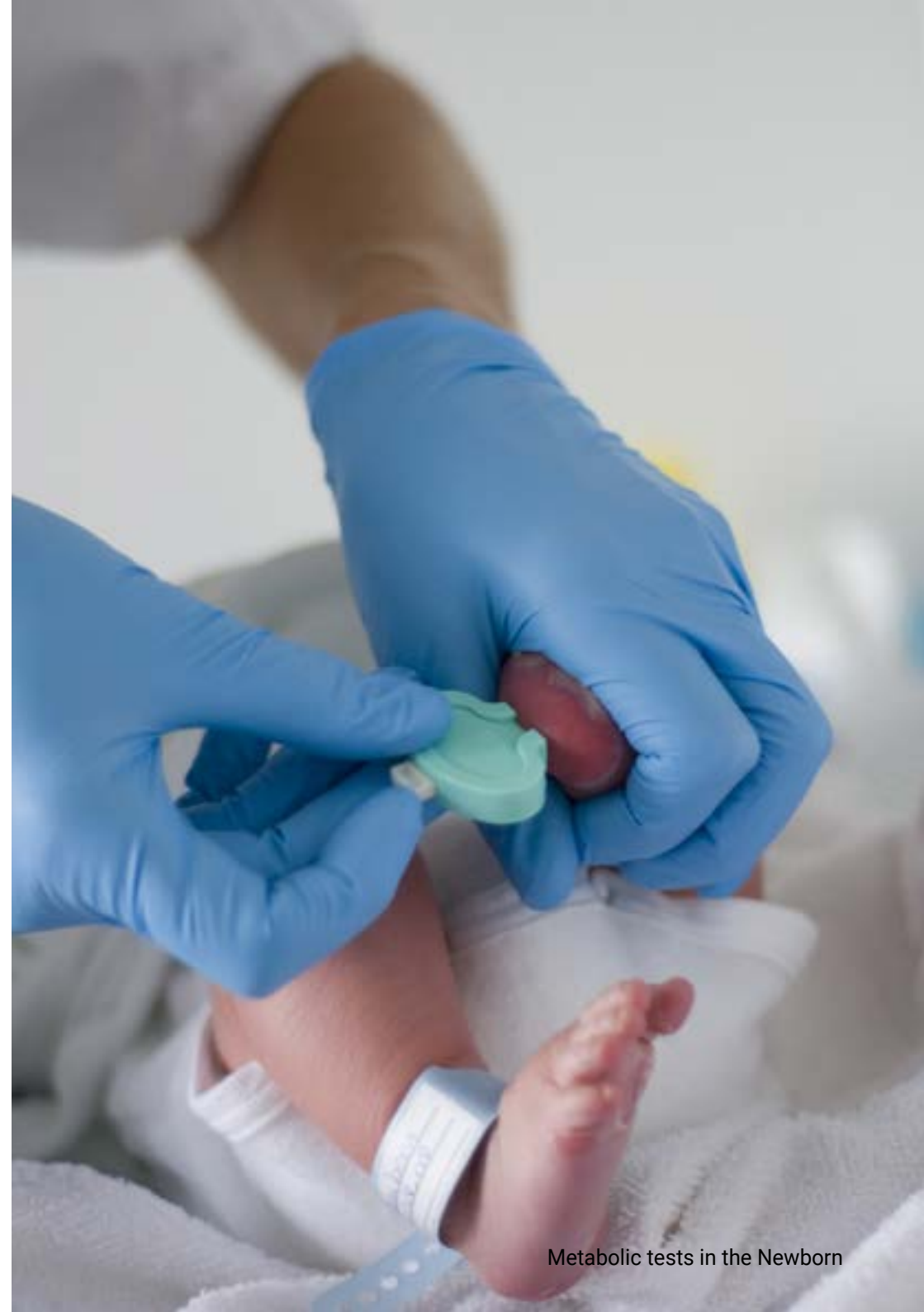
Metabolic tests in the Newborn