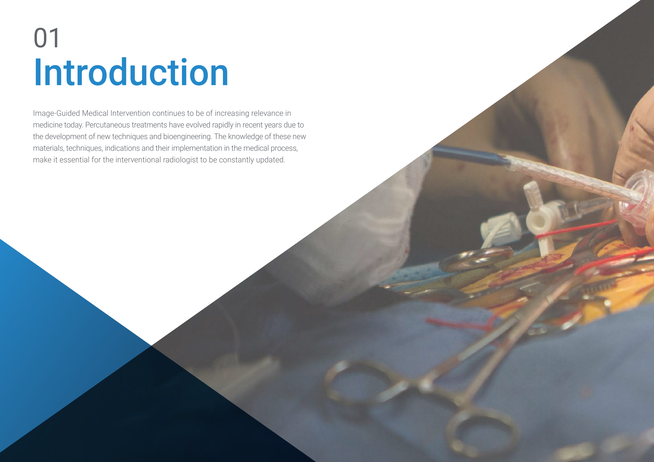
Image-Guided Medical Intervention continues to be of increasing relevance in medicine today. Percutaneous treatments have evolved rapidly in recent years due to the development of new techniques and bioengineering. The knowledge of these new materials, techniques, indications and their implementation in the medical process, make it essential for the interventional radiologist to be constantly updated.