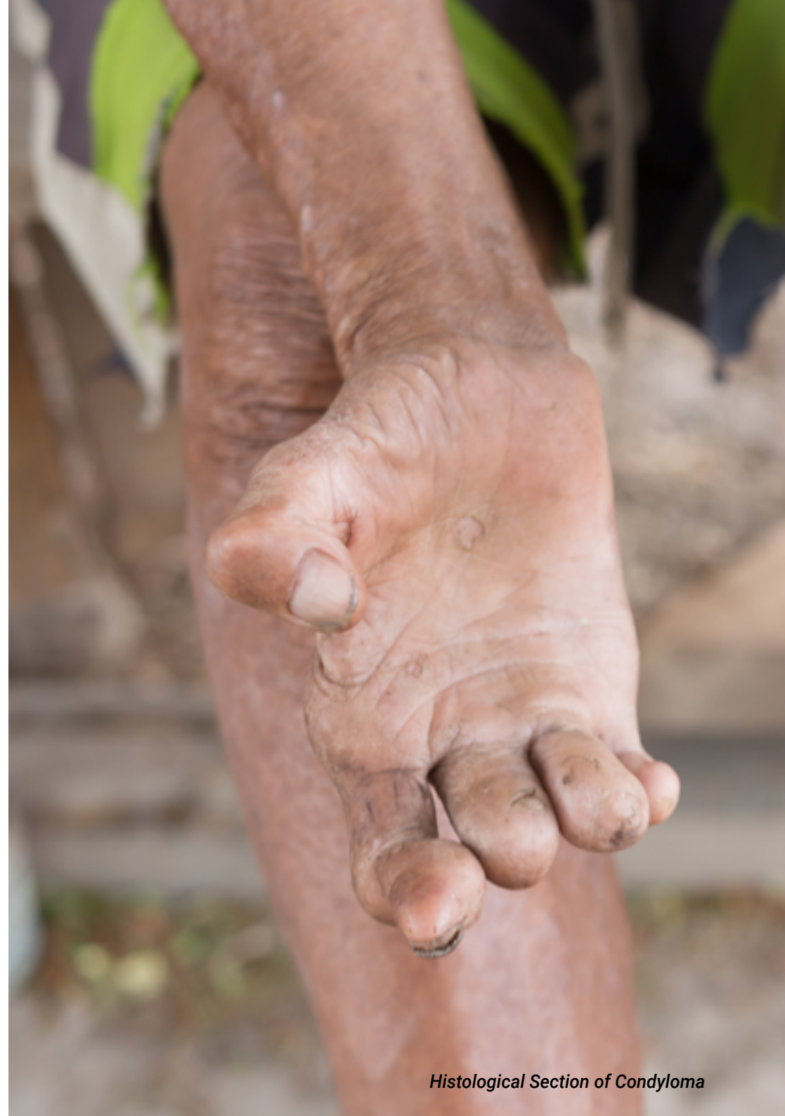
Histological Section of Condyloma