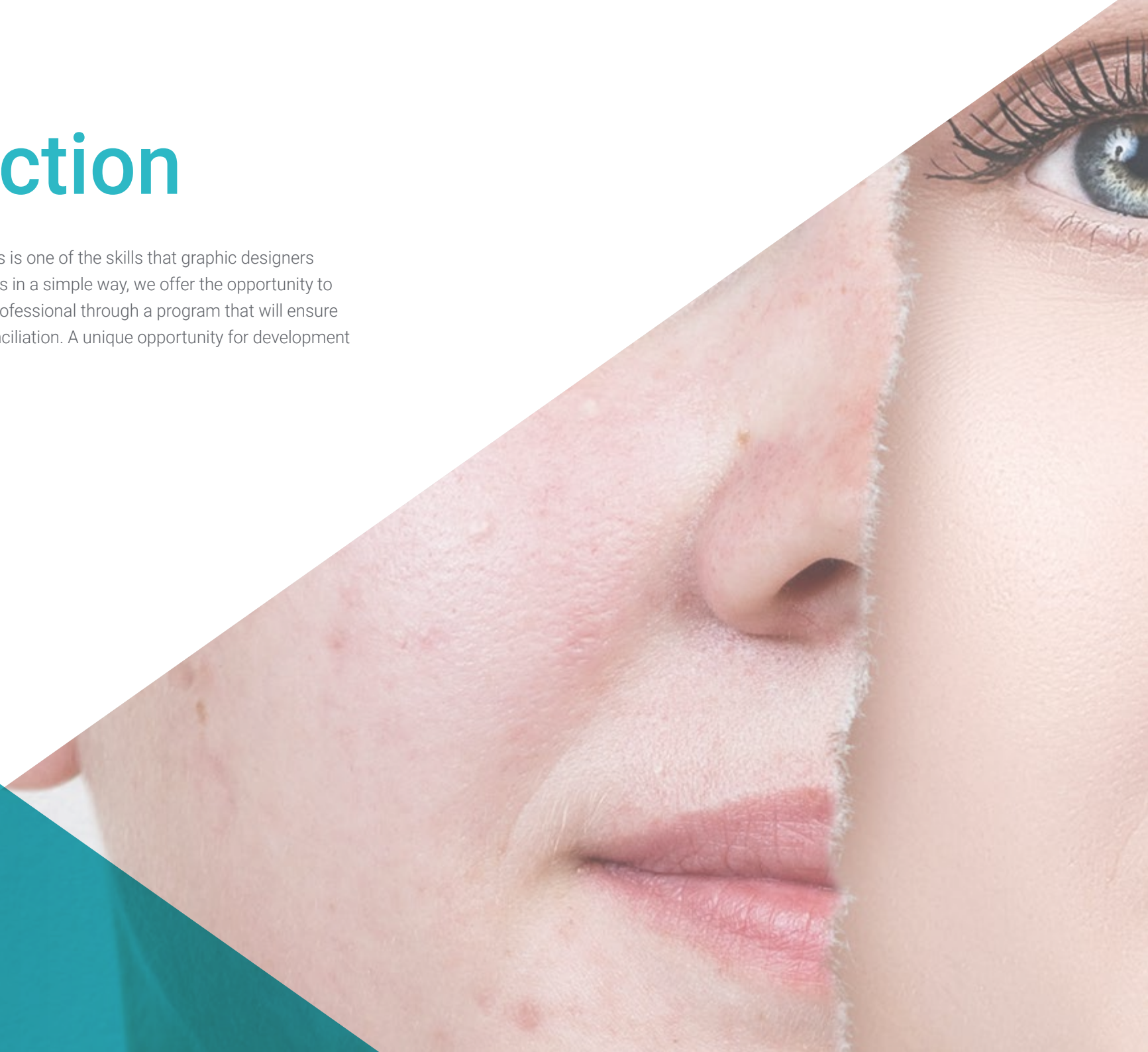
Image processing for use in designs is one of the skills that graphic designers must master. In order to achieve this in a simple way, we offer the opportunity to acquire the skills of a specialized professional through a program that will ensure job growth without problems of conciliation. A unique opportunity for development and promotion.