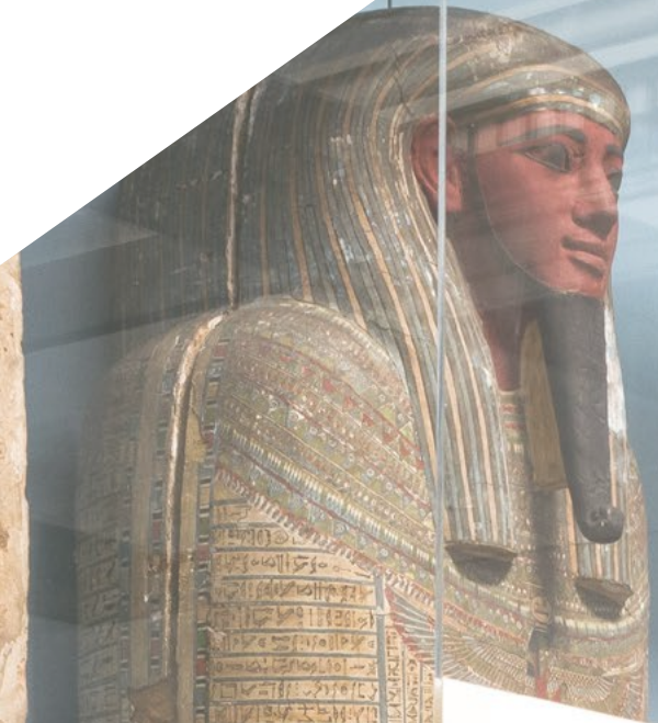
EVOLUTION OF COFFINS, c.170-300 BC