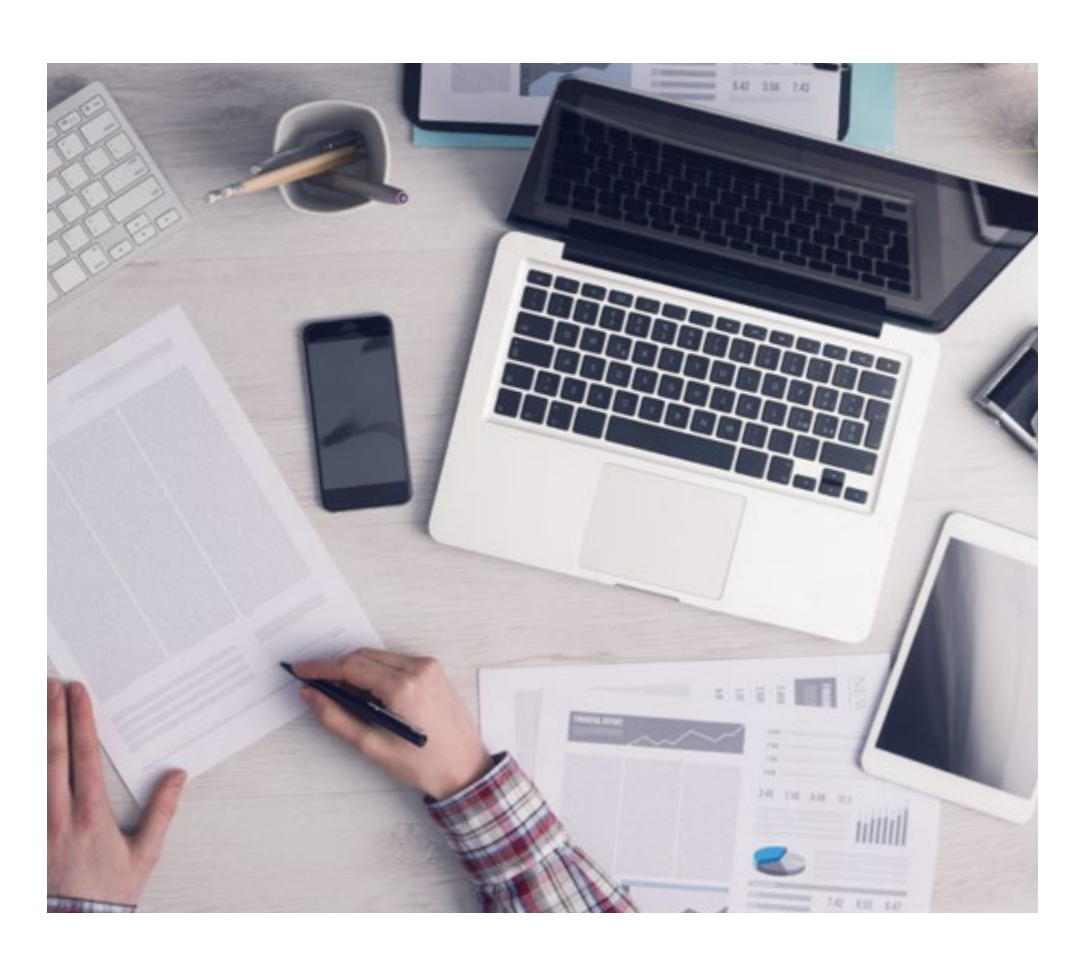
The student will learn, through collaborative activities and real cases, how to solve complex situations in real business environments.